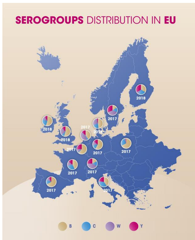
Neisseria meningitidis serogroup distribution across Europe 17

An example of the unpredictable nature of meningococcal meningitis is the recent spread of a virulent W serogroup which caused outbreaks across the UK and several other European countries, South Africa, Brazil, Argentina, Chile and Australia. 16