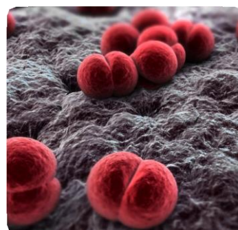
Magnification of Neisseria meningitidis , a gram-negative bacterium that can cause meningococcal meningitis

In addition to the devastating effect on the individuals and their family, severe meningococcal infections result in significant while underestimated lifetime costs for society (more than £1.8 million of societal lifelong costs reported in UK). 2